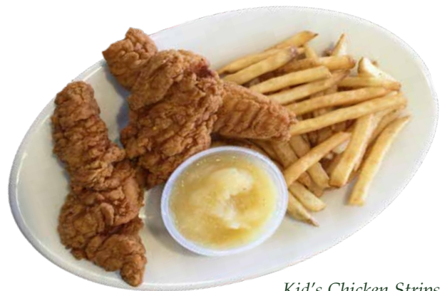
Kid's Chicken Strips

With your choice of sauce and garlic bread 6.99