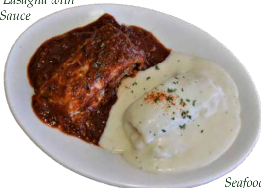
Seafood Lasagna with Alfredo

Pick any 2 pastas and any 2 sauces to create your own platter 15.99