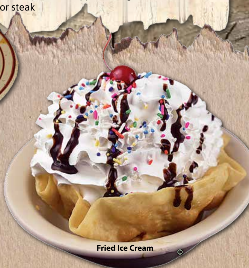
Fried Ice Cream