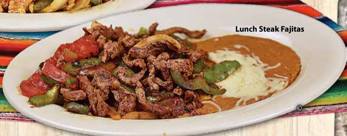
Lunch Steak Fajitas