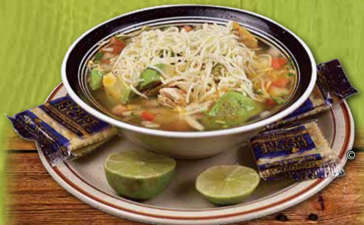
Chicken Tortilla Soup - 11.25

Grilled chicken breast served with rice, beans, guacamole salad, and choice of flour or corn tortillas.