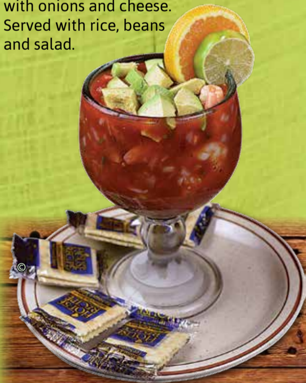
Shrimp Cocktail - 14.95

Your choice of chicken, steak, or pork grilled with onions and cheese. Served with rice, beans and salad.