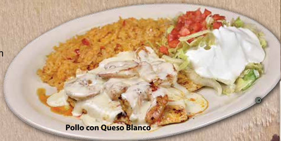
Pollo con Queso Blanco

Grilled jumbo shrimp over a bed of rice, covered with cheese sauce. Served with flour tortillas