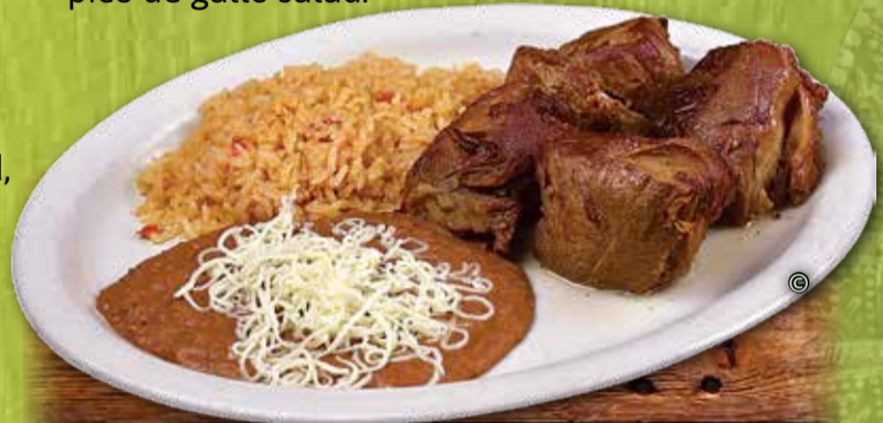
Carnitas - 14.95

Grilled rib-eye steak served on a bed of ranchero sauce. Served with rice, beans, and pico de gallo salad.