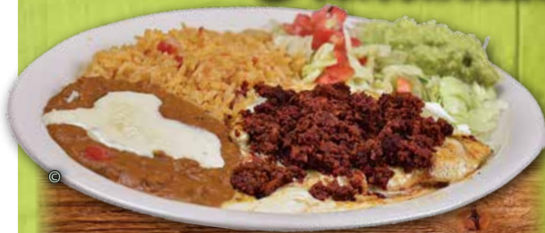
Pollo Toluca - 14.95

Grilled tender chicken breast covered with white cheese sauce and chorizo (Mexican sausage). Served with rice and beans with guacamole salad. Choice of flour or corn tortillas.