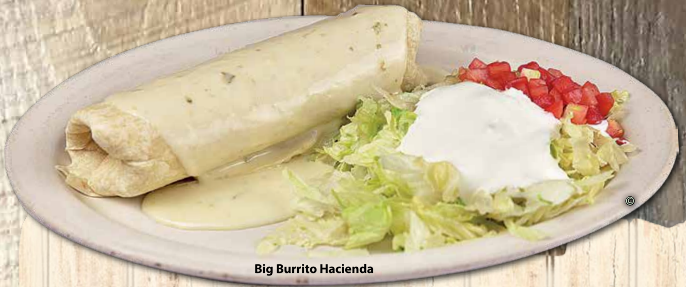
Big Burrito Hacienda