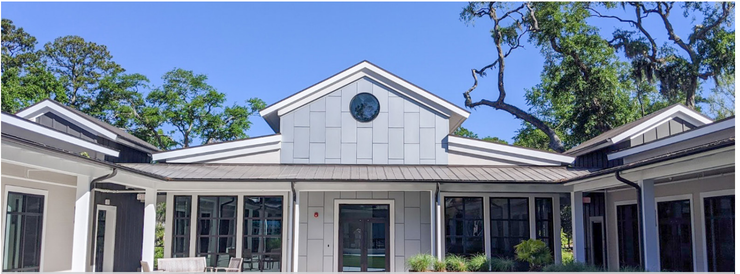
Strauss Office Complex