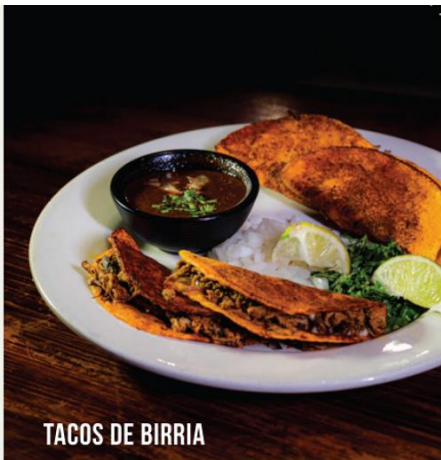
TACOS DE BIRRIA