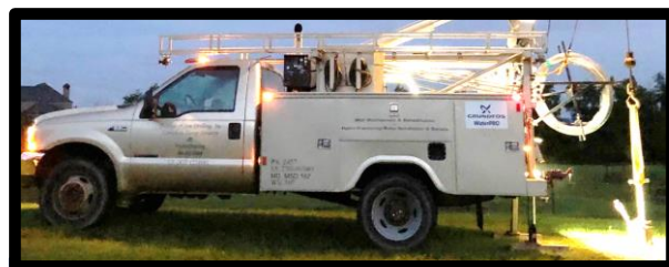
Service Call (Just to show up) - $250

ACTIVATE your 3 Months FREE WelGard® Protection For FULL benefits before Closing