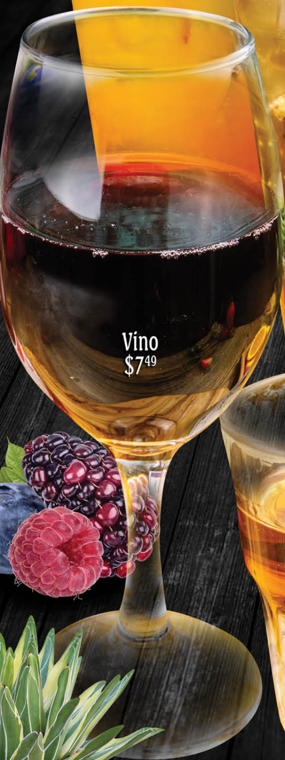
Vino $7 49