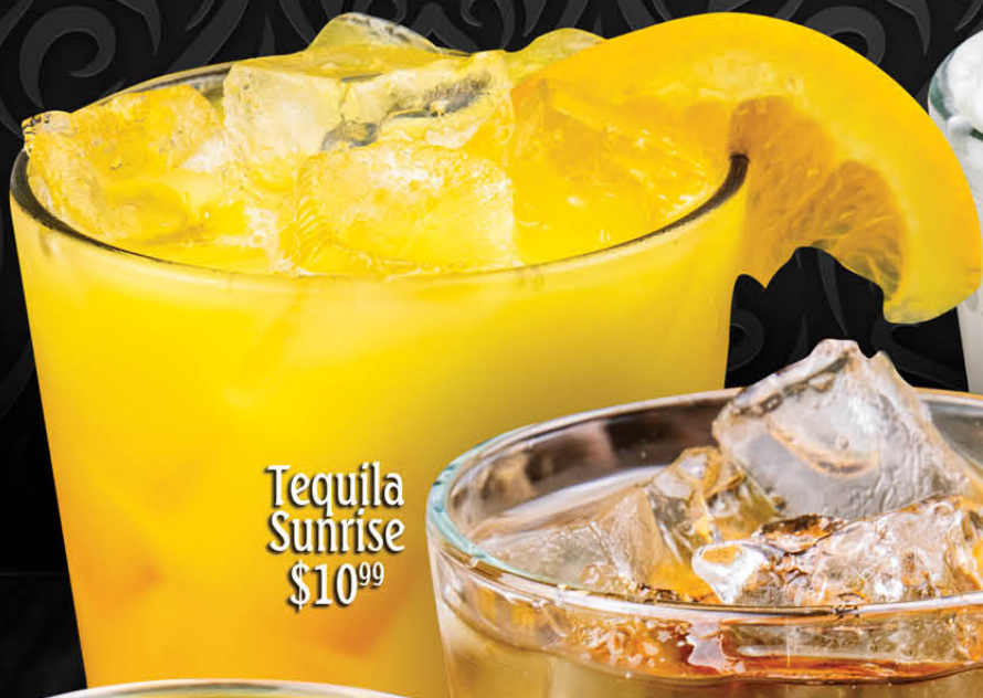
Tequila Sunrise $10 99