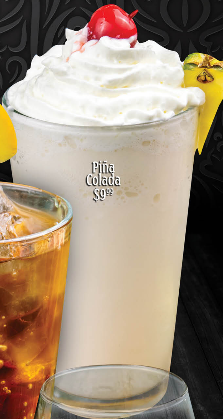
Piña Colada $9 99