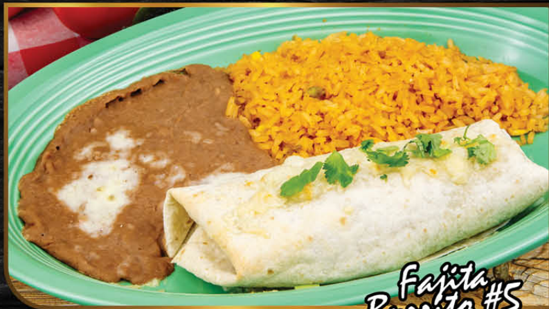
Fajita Burrito #5

*Consuming raw or undercooked meats, poultry, seafood, shellfish, or eggs, may increase your risk for foodborne illness.