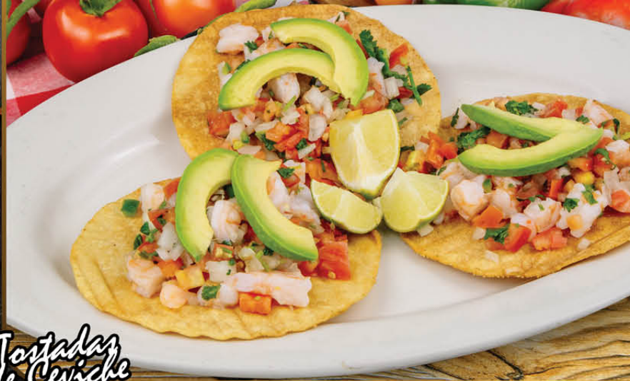
Tostadas de Ceviche

*Consuming raw or undercooked meats, poultry, seafood, shellfish, or eggs, may increase your risk for foodborne illness.