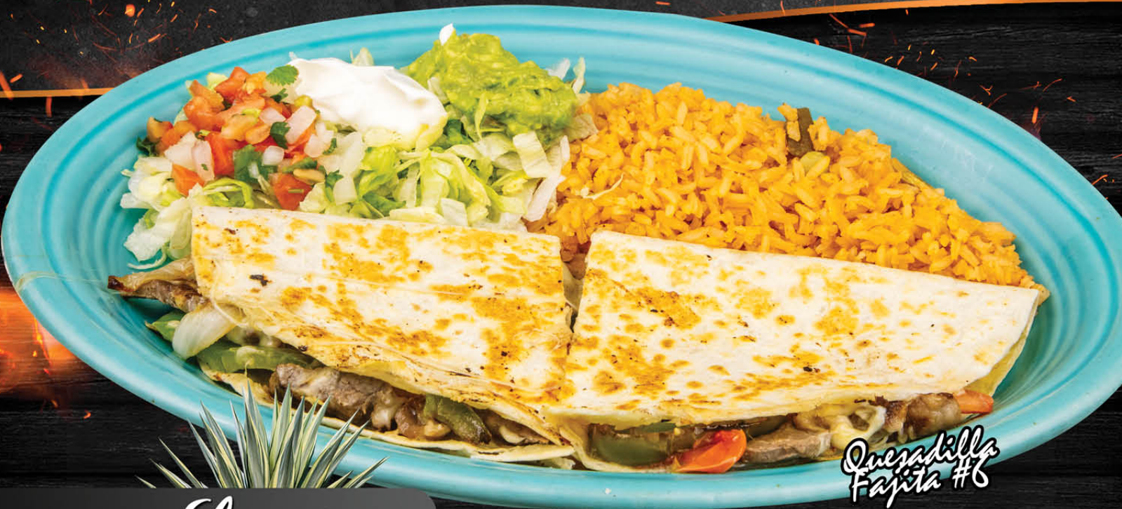
Quesadilla Fajita #6