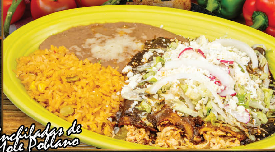
Enchiladas de Mole Poblano