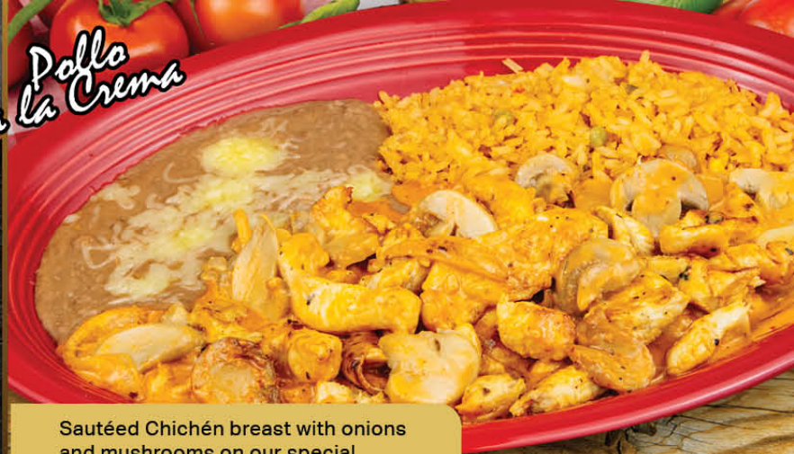
Sautéed Chichén breast with onions and mushrooms on our special chipotle cream sauce. $12.89