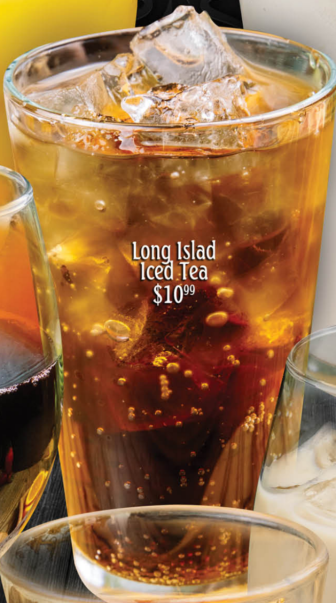
Long Island Iced Tea $10 99