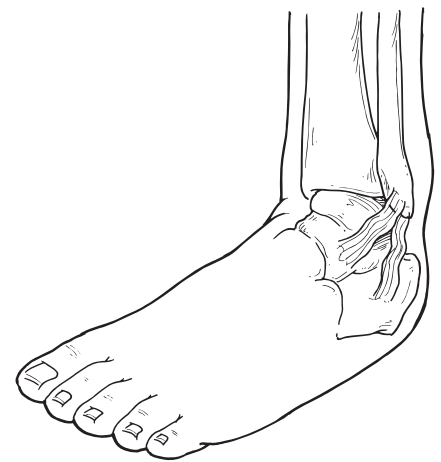
Injured ankle with laxity of ligaments

surgeon will ask you about any previous ankle injuries and instability. Then he or she will examine your ankle to check for tender areas, signs of swelling, and instability of your ankle as shown in the illustration. X-rays, CT scans, or MRIs may be helpful in further evaluating the ankle.