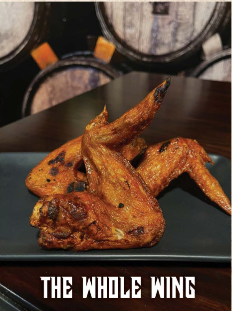
THE WHOLE WING

Buffalo Nashville Hot Sweet Chili Garlic Sweet BBQ Carolina Gold Alabama White