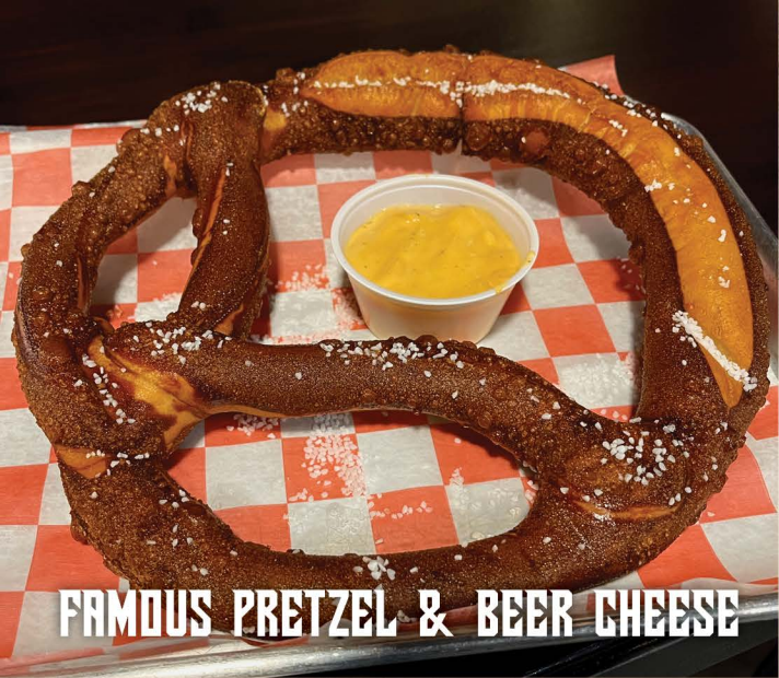
FAMOUS PRETZEL & BEER CHEESE