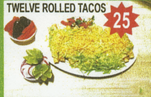
TWELVE ROLLED TACOS