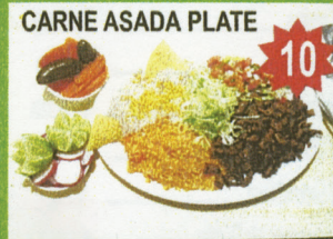
CARNE ASADA PLATE