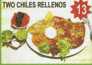
TWO CHILES RELLENOS