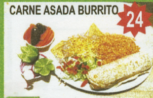
CARNE ASADA BURRITO