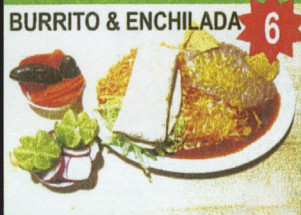
BURRITO & ENCHILADA