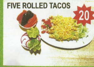
FIVE ROLLED TACOS