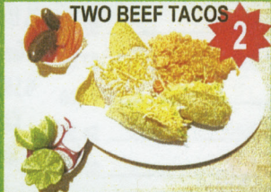
TWO BEEF TACOS