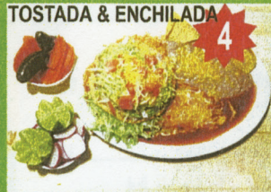
TOSTADA & ENCHILADA