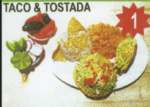
TACO & TOSTADA