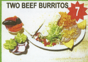
TWO BEEF BURRITOS