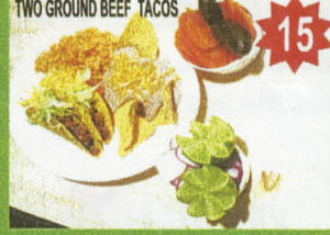
TWO GROUND BEEF TACOS