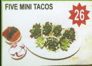
FIVE MINI TACOS