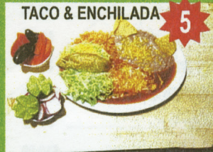
TACO & ENCHILADA