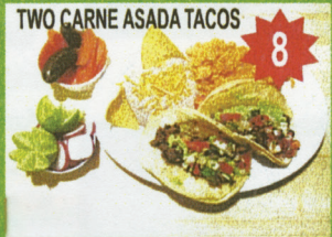
TWO CARNE ASADA TACOS