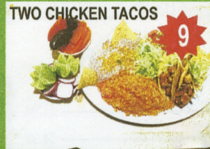
TWO CHICKEN TACOS