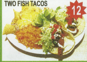
TWO FISH TACOS