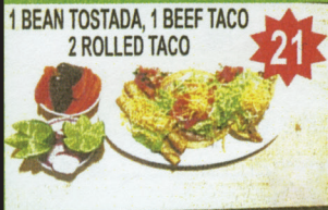
1 BEAN TOSTADA, 1 BEEF TACO 2 ROLLED TACO