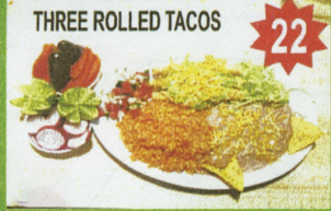
THREE ROLLED TACOS