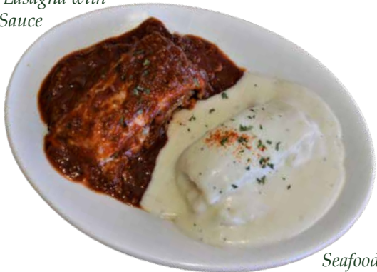
Seafood Lasagna with Alfredo

Pick any 2 pastas and any 2 sauces to create your own platter 15.99